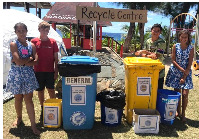
Student sustainability monitors at the gala Recycle Centre were available to provide advice on where waste goes.

Used biodegradable plates and cutlery went to Titikaveka Growers for composting. Plus gala prizes were intentionally chosen to be low waste and minimising throwaway plastic items.