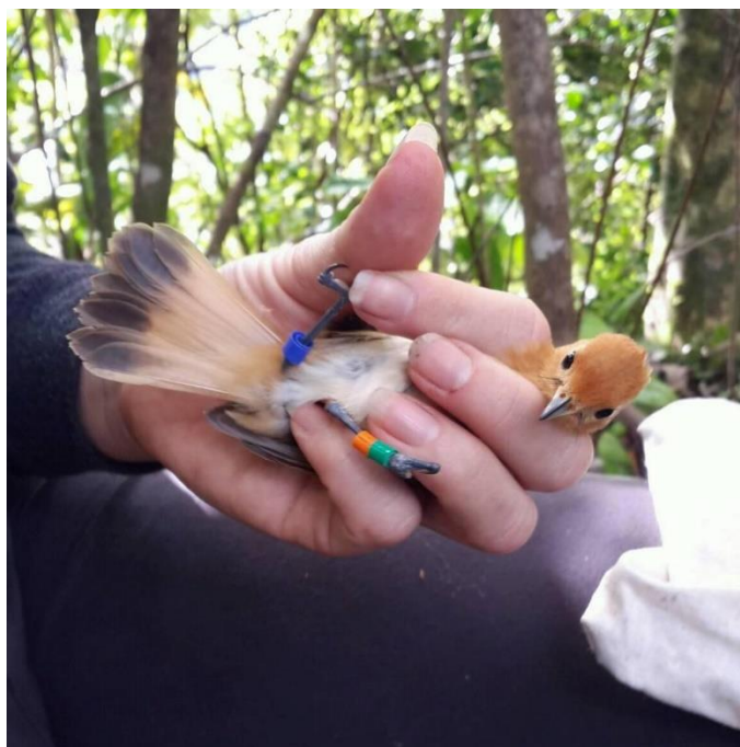
Everyone's darling, the Kakerori brought back from the brink of extinction

Some of the birds in the Cook Island's are endemic, meaning they are only naturally found here in the world and nowhere else. Astonishingly some are only found on individual islands. For example, the Kakerori (Flycatcher/Monarch), and the I'oi (Starling) are only naturally found in Rarotonga. And the Tanga'eo (Kingfisher) is only found in Mangaia, and Kopeka (Swiftlet) is only found in Atiu!