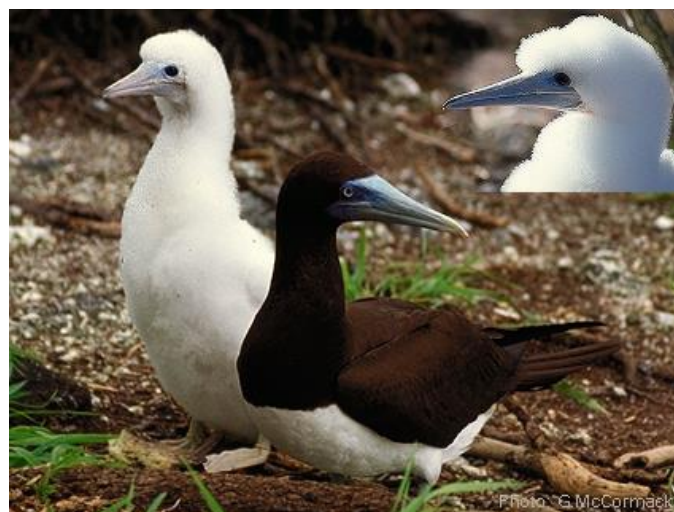
The Kena or Brown Booby deserves a vote

Here in the Cook Islands we are blessed with some amazing birdlife. Perhaps the time has come for a Cook Islands Bird of the Year competition! (not to be confused with the recent Miss Cook Islands event). Seriously, which bird would you vote for?