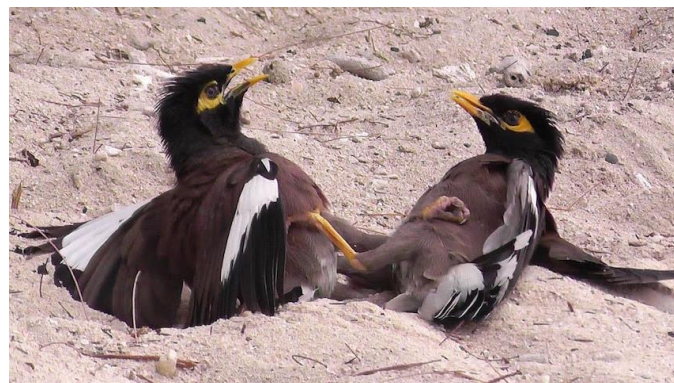
Don't let the bullies win

The Mynah has most definitely NOT been invited to participate in this year's Bird of the Year competition, despite rumours you may have heard to the contrary (rumours we suspect were started by the Myna bird itself). Don't let the bullies win. Be like Napoleon Dynamite and Vote for I'oi !