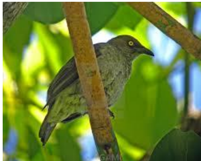
The melodic I'oi or Rarotonga Starling – once common in coastal lowlands, now hiding in the rugged interior

Of course, this introverted birdy behaviour is also likely due to the bully boy tactics of the dirtbag Mynah bird, introduced in 1915 to control the Coconut Stick-insect.