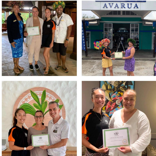
Four of our nine Gold Corporate members of TIS for 2021-22. Pacific Resort, CITC, Motu, Capital Security Bank Limited (top left to right)

Corporate, individual and family membership fees can now be done online by filling out your details here . On this page are instructions on how best to proceed with online membership payment based on where you currently reside.