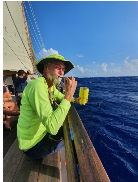
Birthday boy pictured, brushing his teeth after breakfast sailing from Aitutaki to Penrhyn on Marumaru Atua 2021